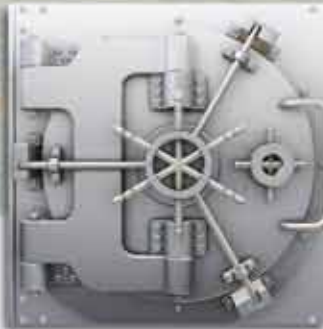
De Lage Landen