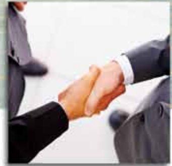
Energy Tax Savers